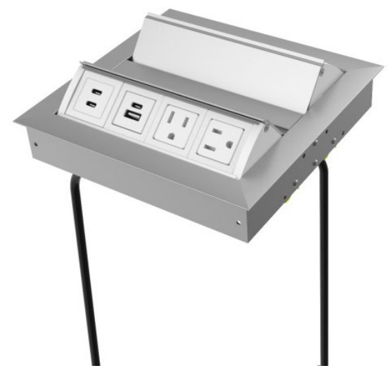
^{\ast} Image shown: 2 Power, 1 Dual USB-A+C, and 1 Dual USB-C 45W on each side