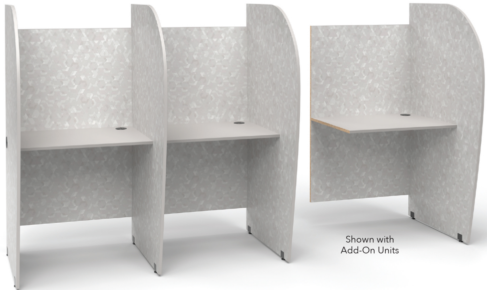
Shown with Add-On Units